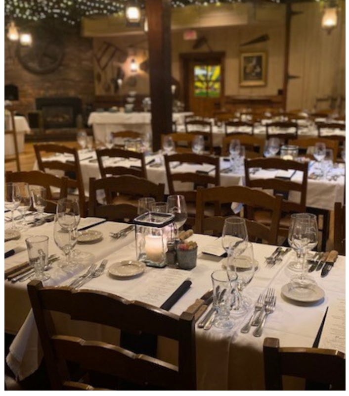
The Owners, Chef, Management and Staff have combined their efforts, commitment and talents to develop and present for you a special & unforgettable dining experience